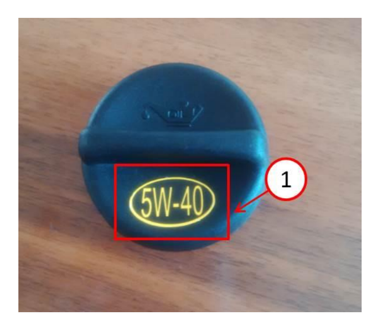
Fig. 3 Cap After Sticker Applied

12. Replace the oil fill cap with the new 5W-40 sticker firmly attached (Fig. 3).